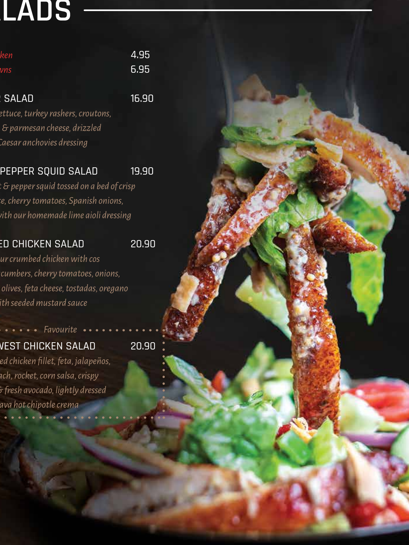
CRUMBED CHICKEN SALAD

Char-grilled chicken fillet, feta, jalapeños, baby spinach, rocket, corn salsa, crispy tostadas & fresh avocado, lightly dressed with our lava hot chipotle crema